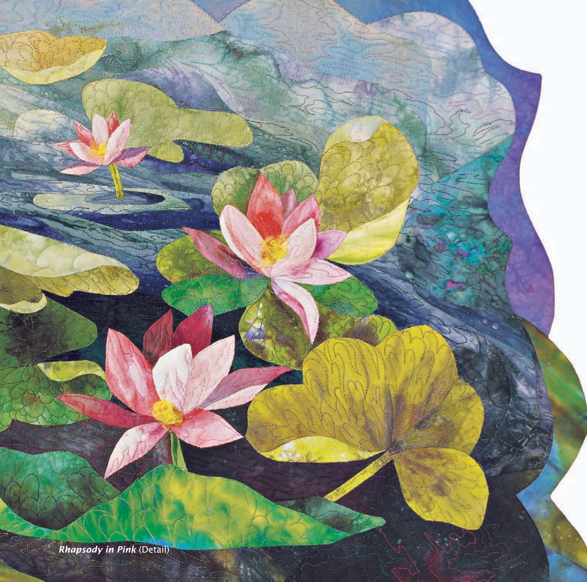
Rhapsody in Pink (Detail)